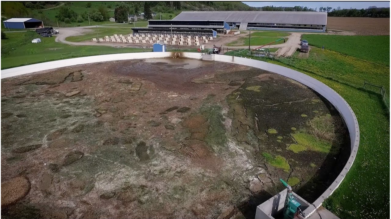
Dairy farm manure lagoon with veal crates in the immediate background and the milking barn in the far background. Watch the video at https://www.youtube.com/watch?v=oSEYfs1V1JY